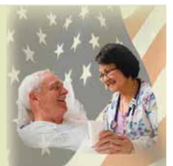
Proudly Serving Our Nation's Veterans